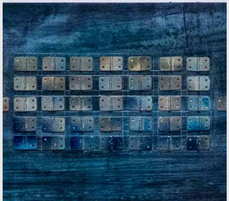
Marie-Denise Douyon. Cavalier de sable (cropped), mixed media, oil and recycled materials on panel, 60 cm x 60 cm, 2015 Sold : Galerie Blanche, Montreal