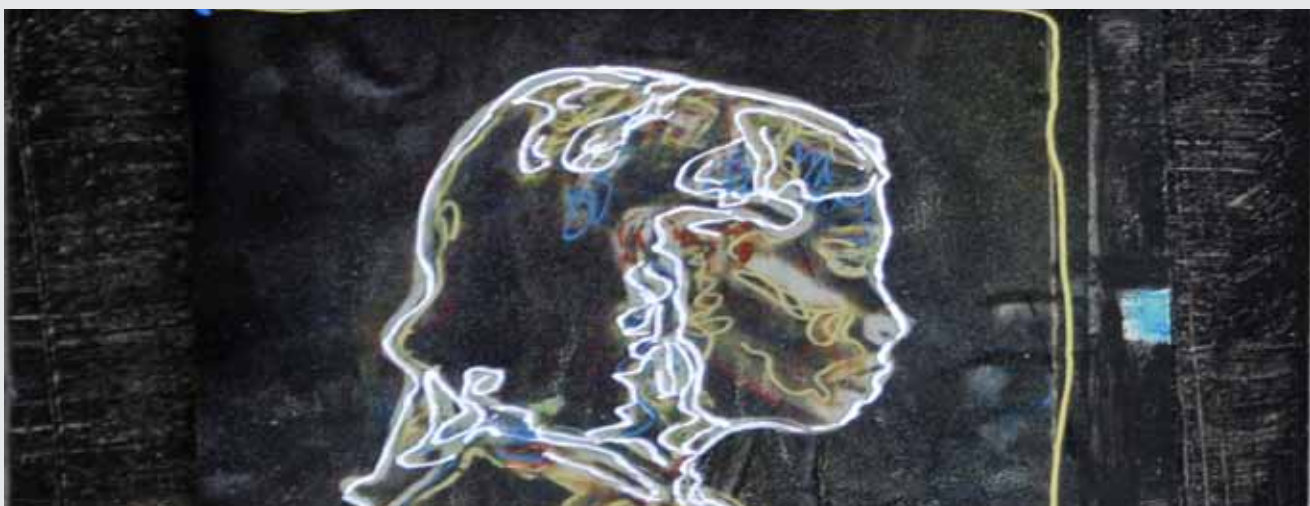
Detaill, Wired Life .