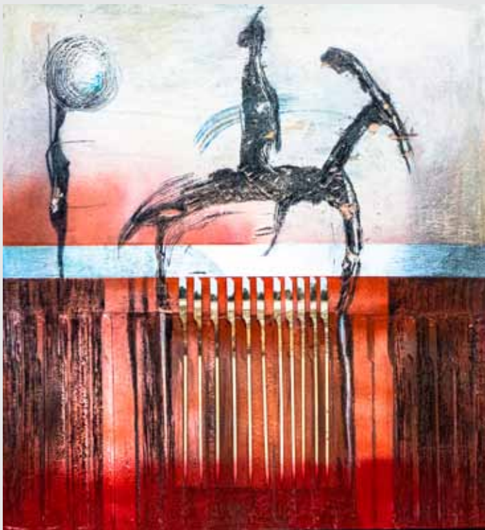
Marie-Denise Douyon. Cavalier d'ombre , mixed media, acrylic and ink on panel, 70 cm x 70 cm, 2015 Sold : Galerie Blanche, Montreal