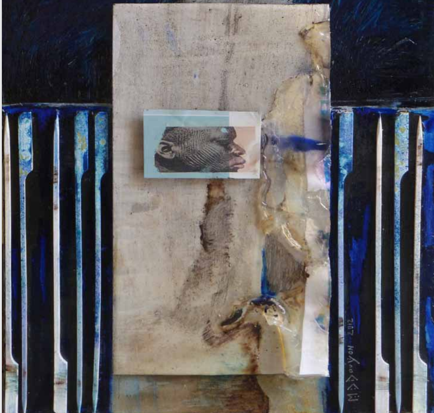
Marie-Denise Douyon. Éko Vertical I, mixed media, oil and recycled materials on wood, 61 cm x 46 cm, 2012 Sold : Galerie Blanche, Montreal

Between the easel and the gesture, between the support and the pigments, interactions occur: the recollection of images, the play, the imaginary journey, the magic of CREATION..