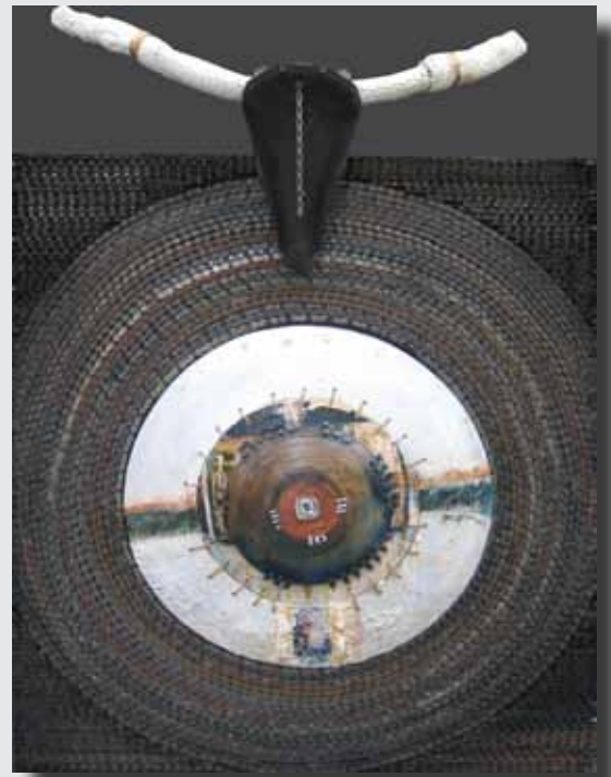
Marie-Denise Douyon. Toro Féraïlle , mixed media, bicycle chains and oil on panel, 91 cm x 81 cm, 2008

In these recent works, her approach is iconographic and contemporary. Douyon combines photos with painting and sets elegant African Madonnas against white backgrounds to advocate for the sacred, for black beauty, motherhood and the wonders of procreation.