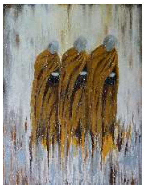
Monks\ walking\ for\ alms\ in\ the\ rain