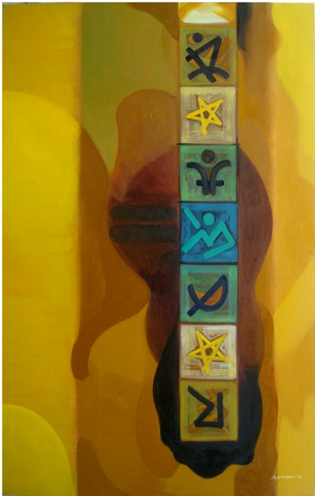
Cosmic, Oil & acrylic on Canvas, 32in X 50in, 2012