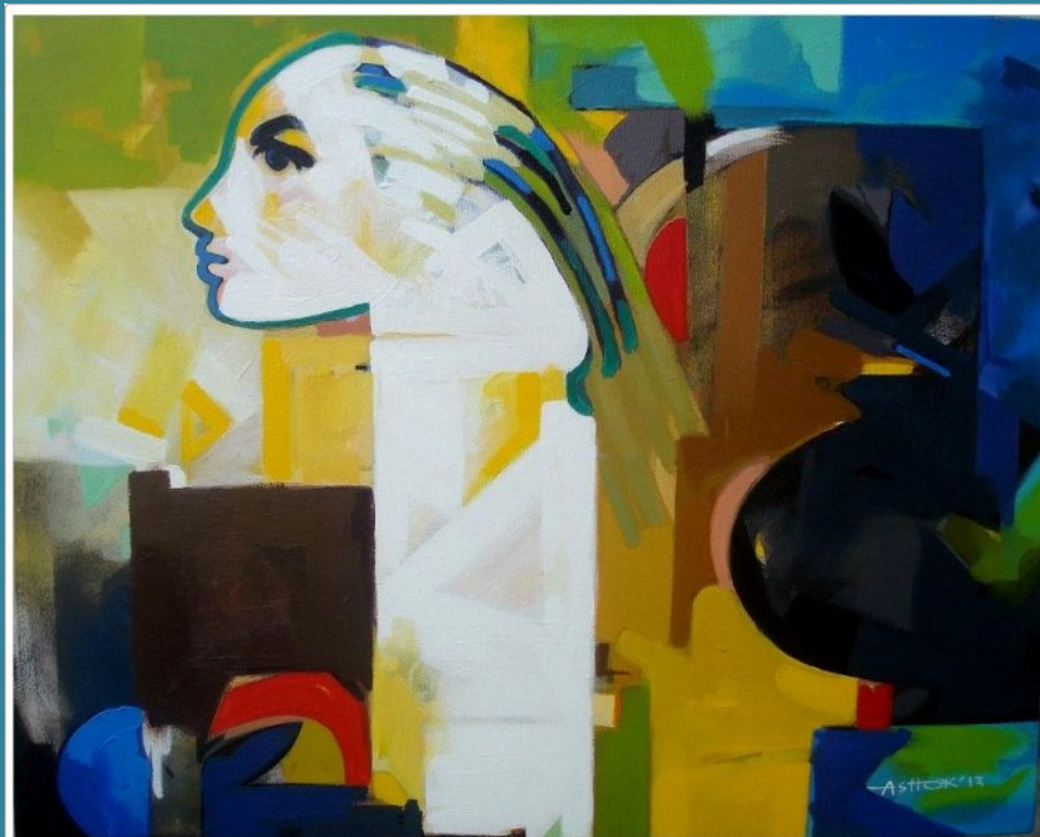
Ceaseless Expression, Acrylic on Canvas, 30inX24in, 2013(Ashok kumar)