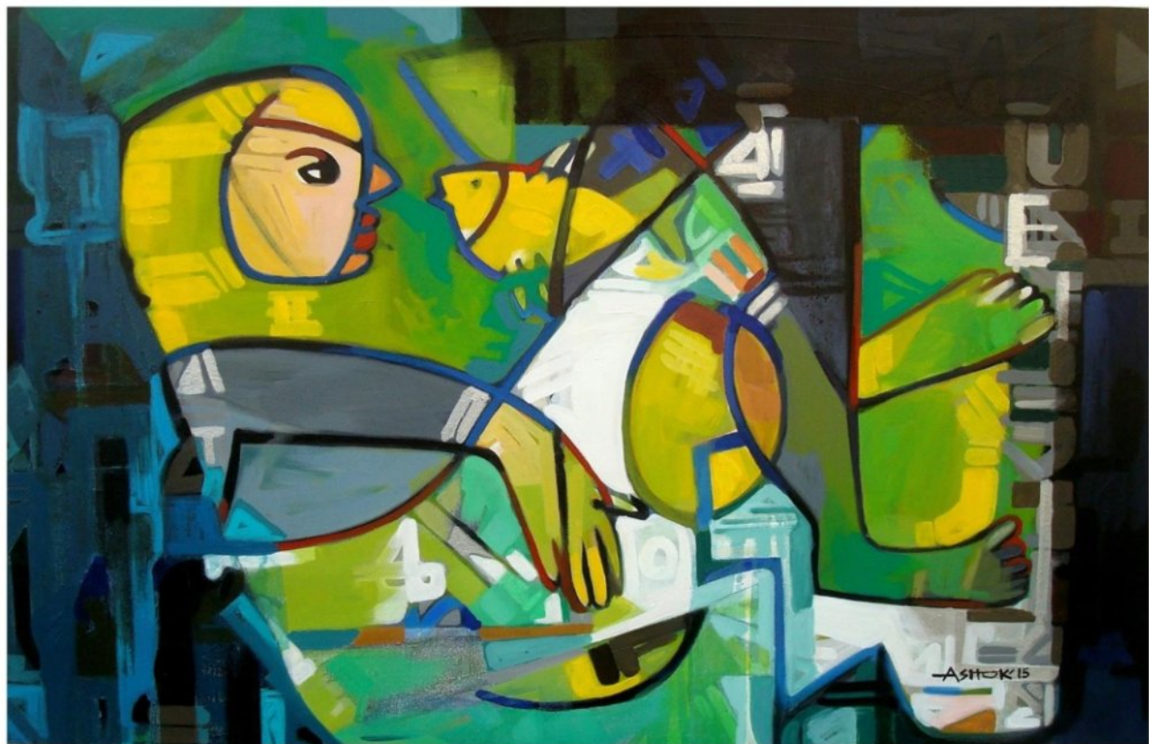
Beautiful Moment, Acrylic on canvas, 127cmX82cm, 2015 (Ashok Kumar)