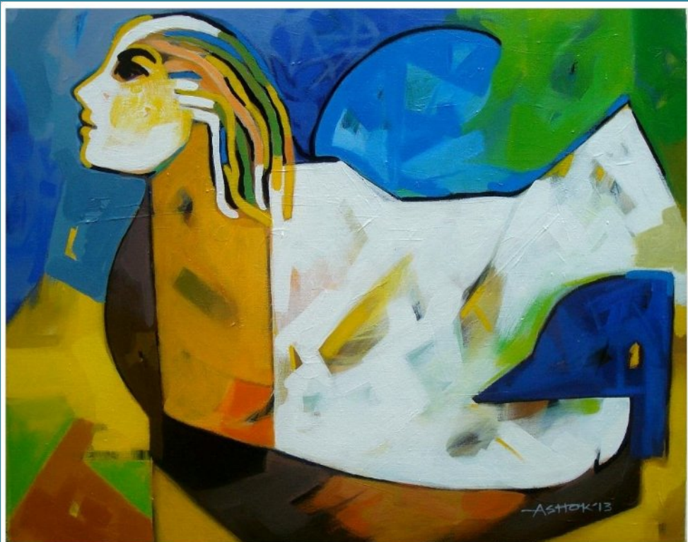
Ceaseless Expression I, Acrylic on Canvas, 30inX24in, 2013(Ashok kumar)