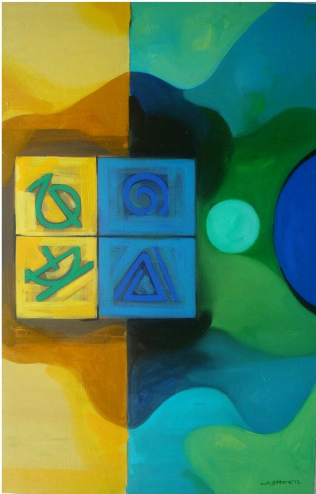
Prakriti, Oil & acrylic on Canvas, 32in X 50in, 2012