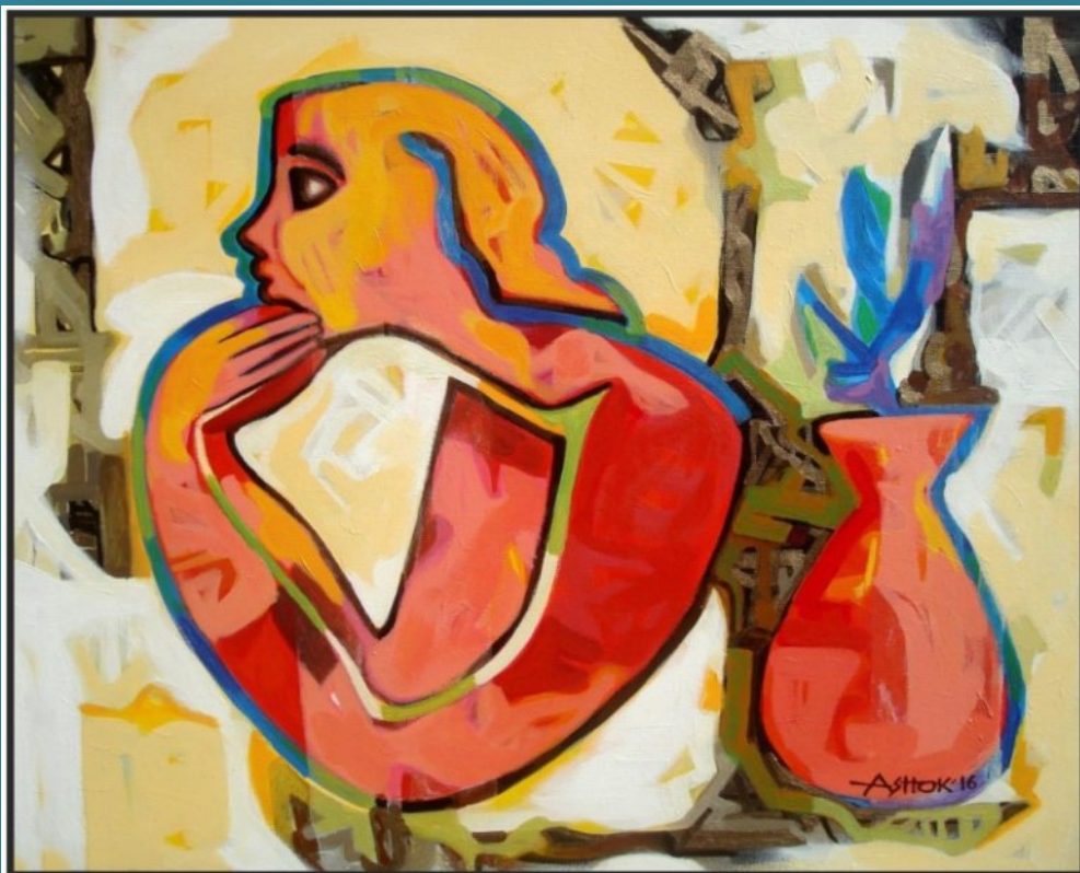
Imagine, Acrylic on Canvas, 30inX24in, 2016 (Ashok Kumar)