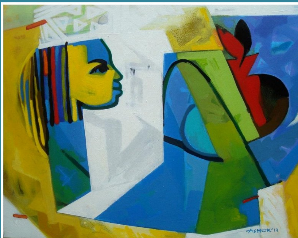
Joy around, Acrylic on canvas, 30in X 24in, 2013 (ashok kumar)